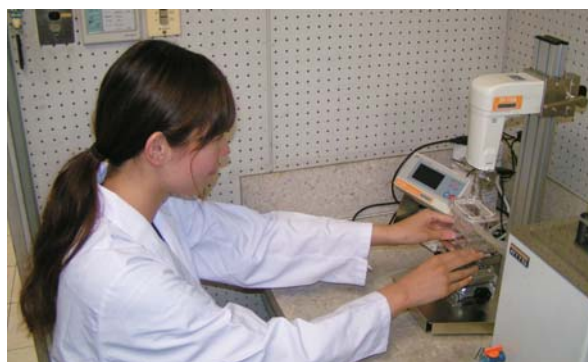
A&D SV-A Tuning Fork Vibro Viscometer